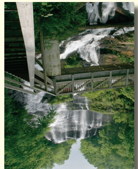
Holcomb Creek Falls